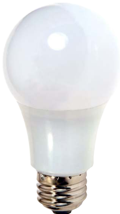
LED15 A19 15W 120V(60Hz) A19 Shape 150° Beamspread E26 Base