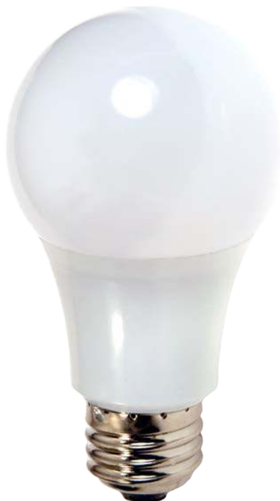
LED15 A19 15W 120V(60Hz) A19 Shape 150° Beamspread E26 Base